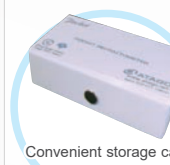
Convenient storage case