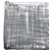
AccuPoint Sampler Pattern