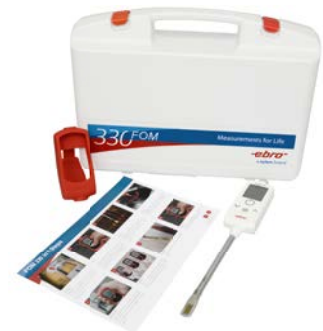
FOM 330-4-Set including hand protection and carrying case