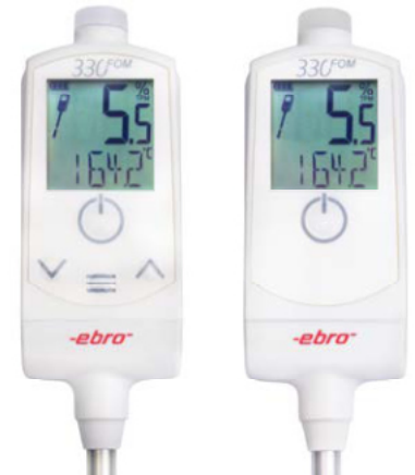
FOM 330-4 and FOM 330-1

In addition to the manual, the scope of delivery includes illustrated step-by-step instructions, as well as a certificate of calibration for proof of the functionality of your device.